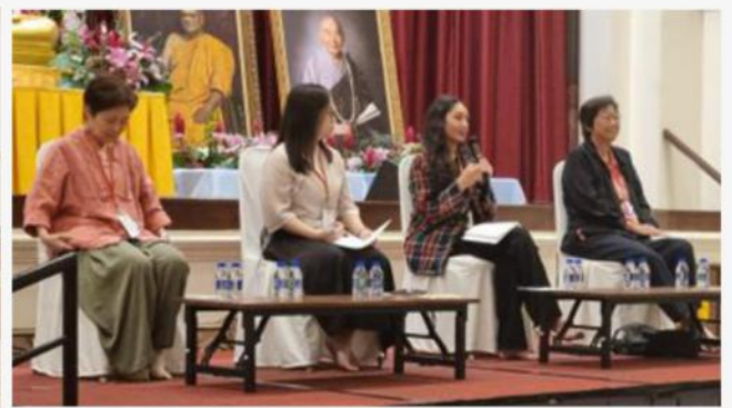
Plenary 2: Moral Education from the youth perspective